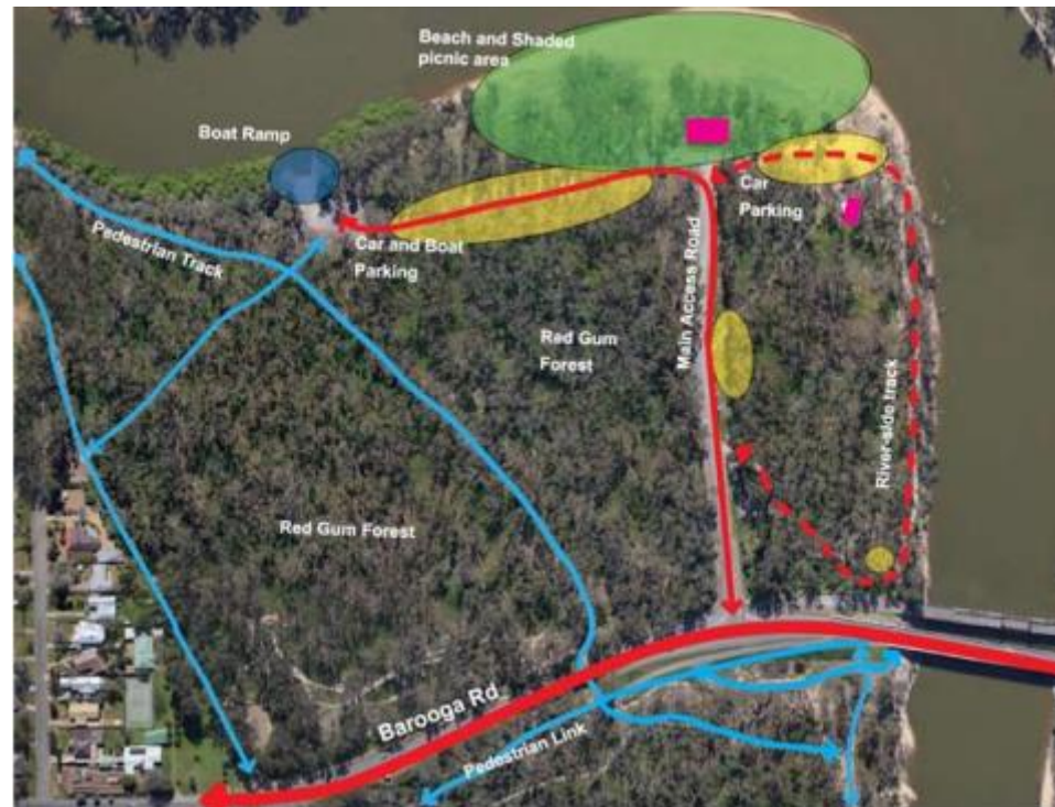
Map of Kennedy Park