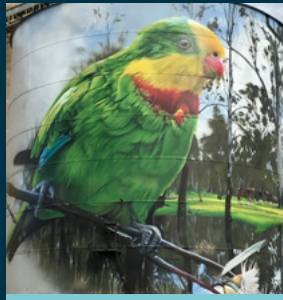
Picola by Jimmy D'Vate