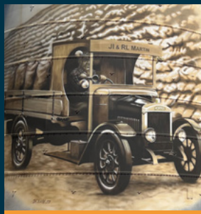
St James