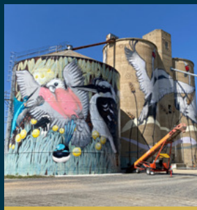
Tungamah by Sobrane Simcock