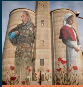
Devenish by Cam Scale