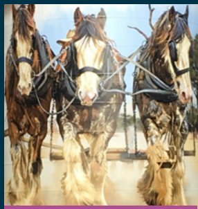
Goorambat by Jimmy D'Vate